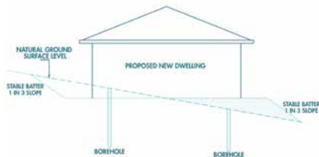
Fig. 2 - Location of exploratory boreholes